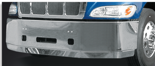
387 years 1999-2001

ABP N31 OHV201006 with fog lights ABP N31 OHV001006 no fog lights (shown)