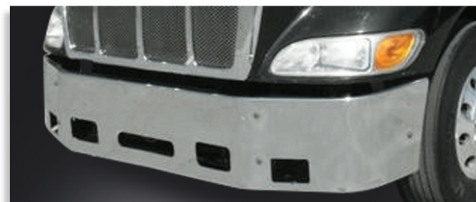
387 years 2002-2010

ABP N31 OHR221016 with fog lights ABP N31 OHR021016 no fog lights (shown) Air dam (optional) - ABP N31 SHRSP